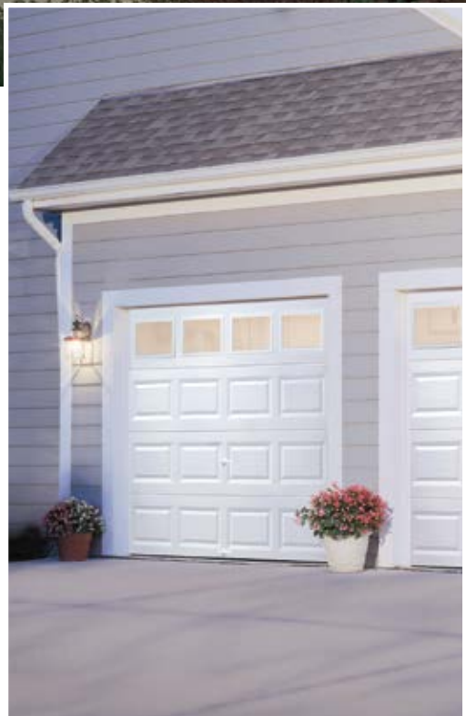
Model T42S, Short Traditional Panel with Plain Short Windows