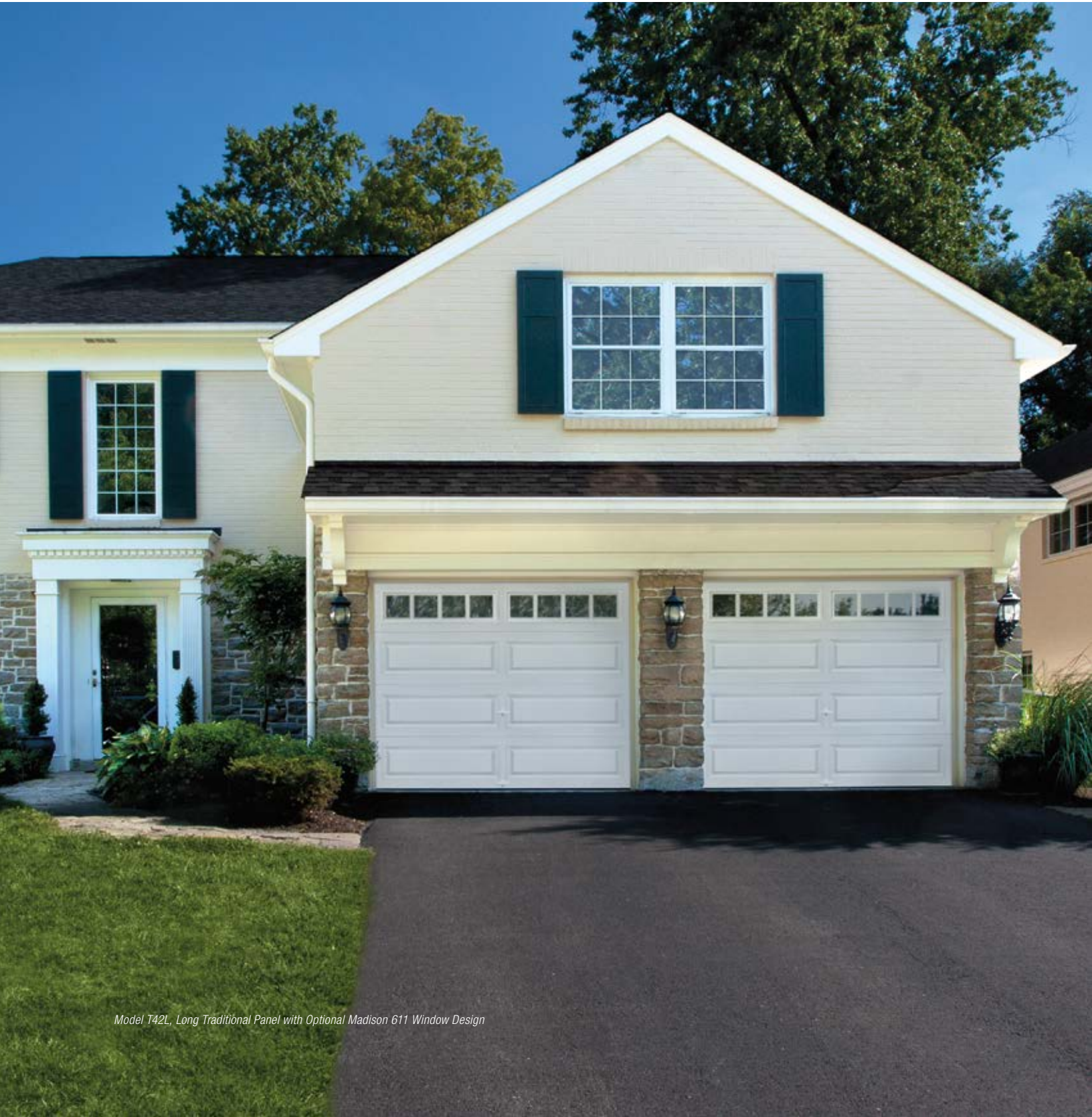
Model T42L, Long Traditional Panel with Optional Madison 611 Window Design