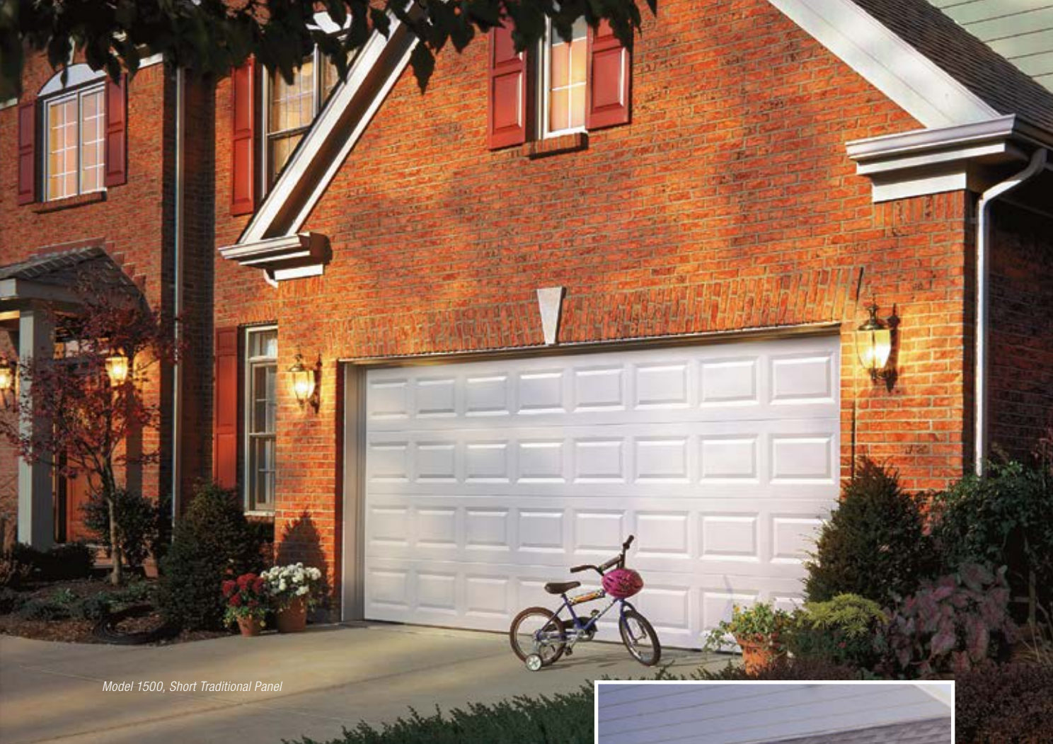
Model 1500, Short Traditional Panel