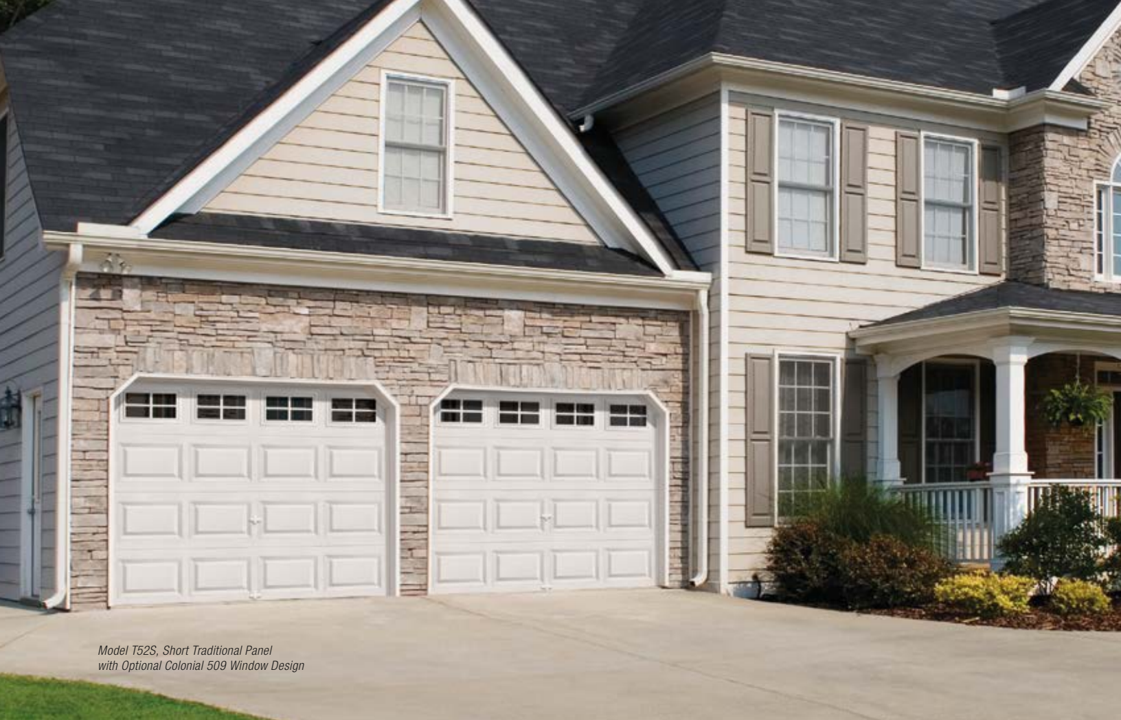
Model T52S, Short Traditional Panel with Optional Colonial 509 Window Design