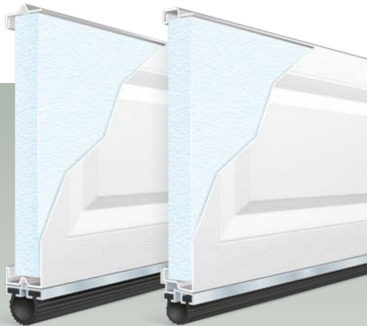
Tongue-and-Groove Section Joints