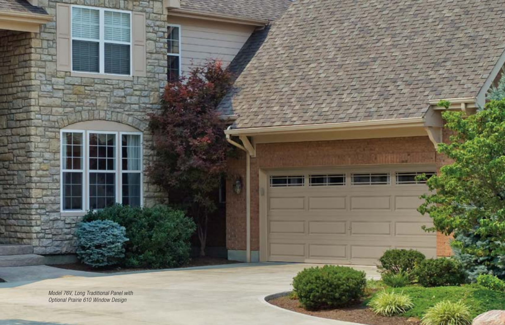
Model 76V, Long Traditional Panel with Optional Prairie 610 Window Design